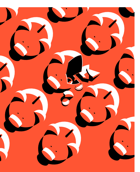
17.4 % of children on PEI live in poverty.

We love where we live, but issues like poverty, homelessness and mental illness are hurting our communities. By showing your local love, you can change that. You can make local issues #UNIGNORABLE .