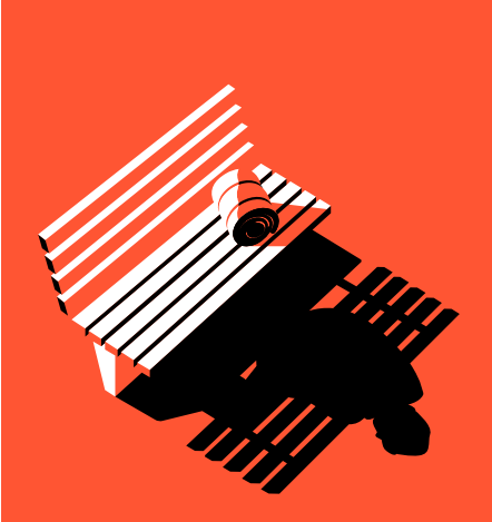
38% of homeless people on PEI are youth ages 16-19.